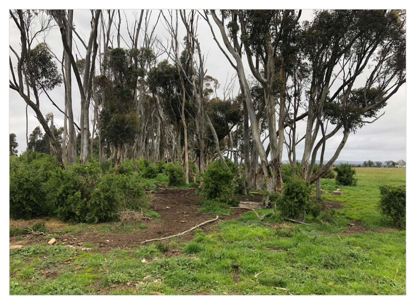
Figure 3-12: Small area of eucalypt with gorse