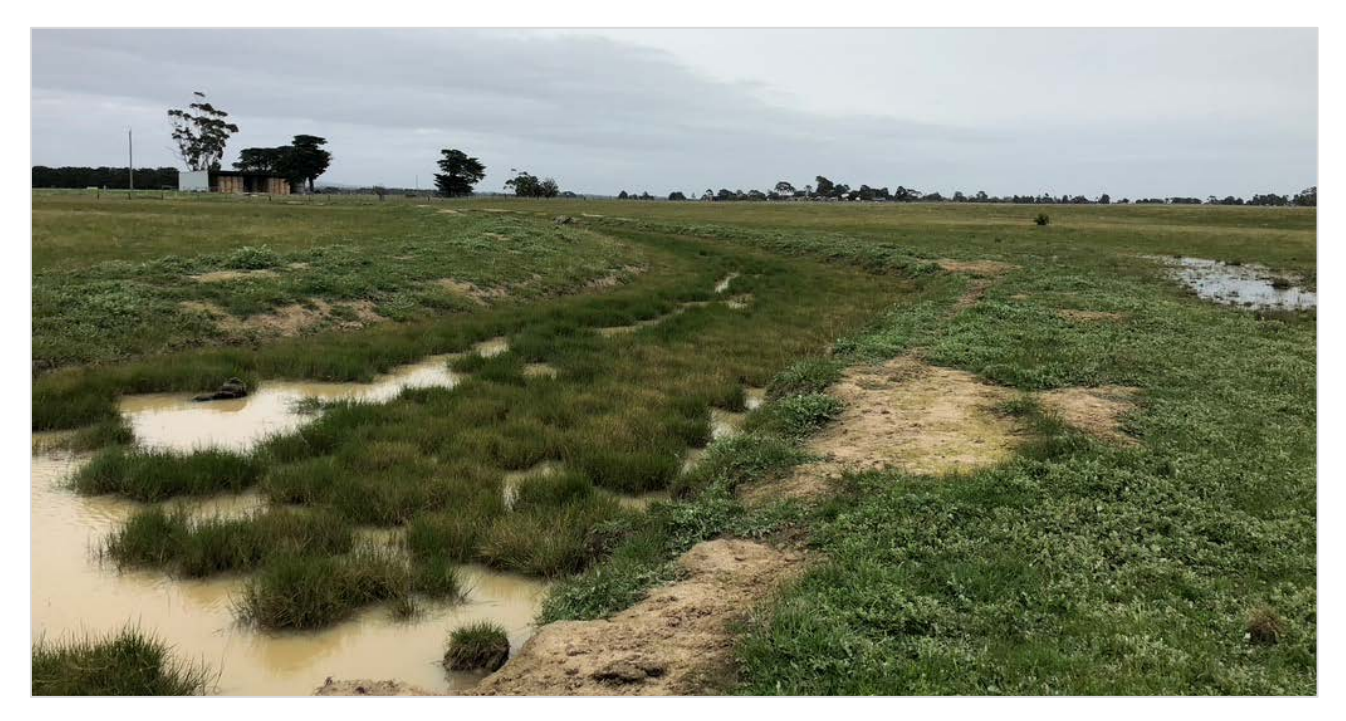
Figure 3-11: Watercourse in the south east corner that appears to have been made into a channel