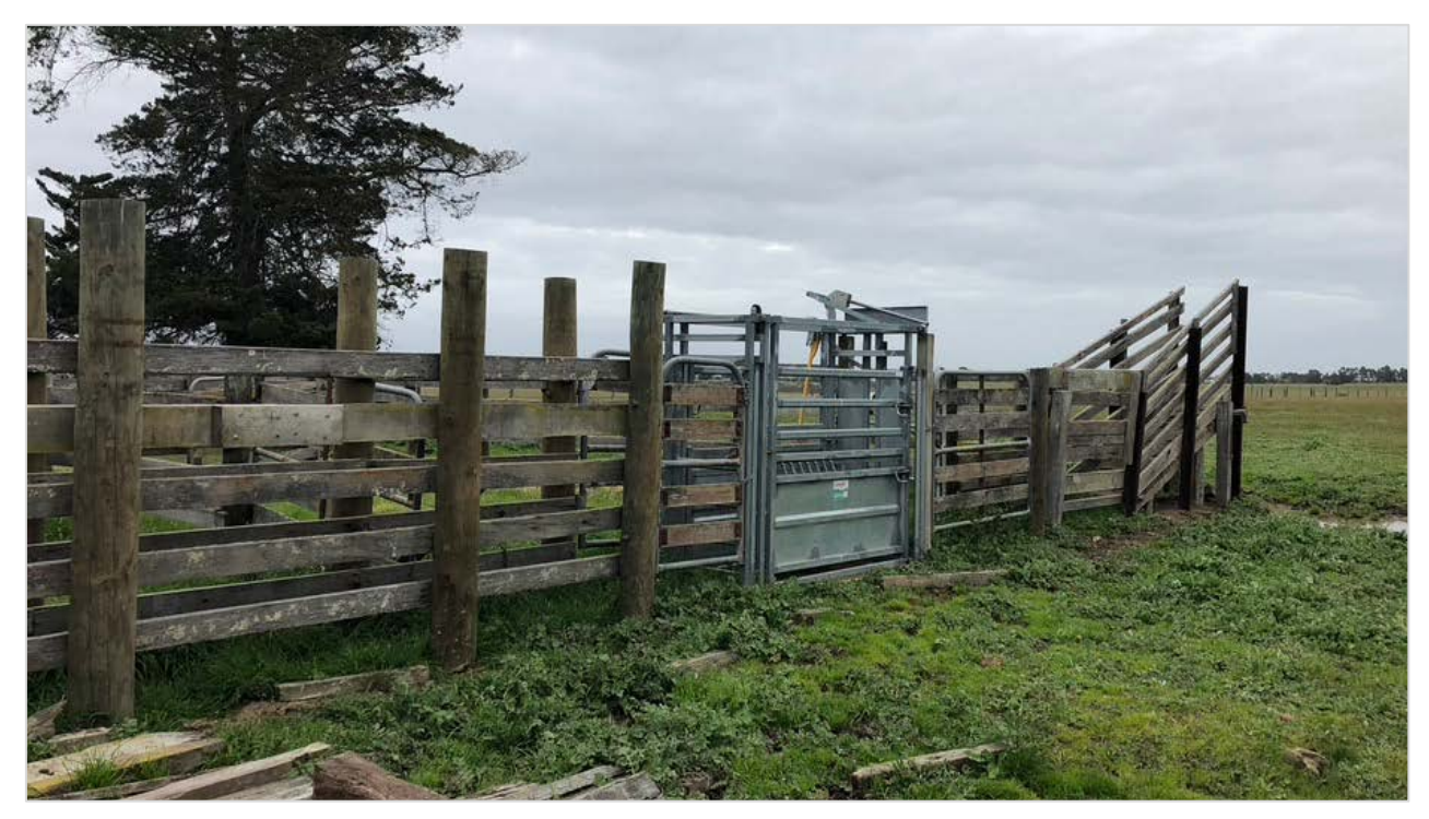
Figure 3-4: Existing yards, cattle crush and race - Image 1, August 2020