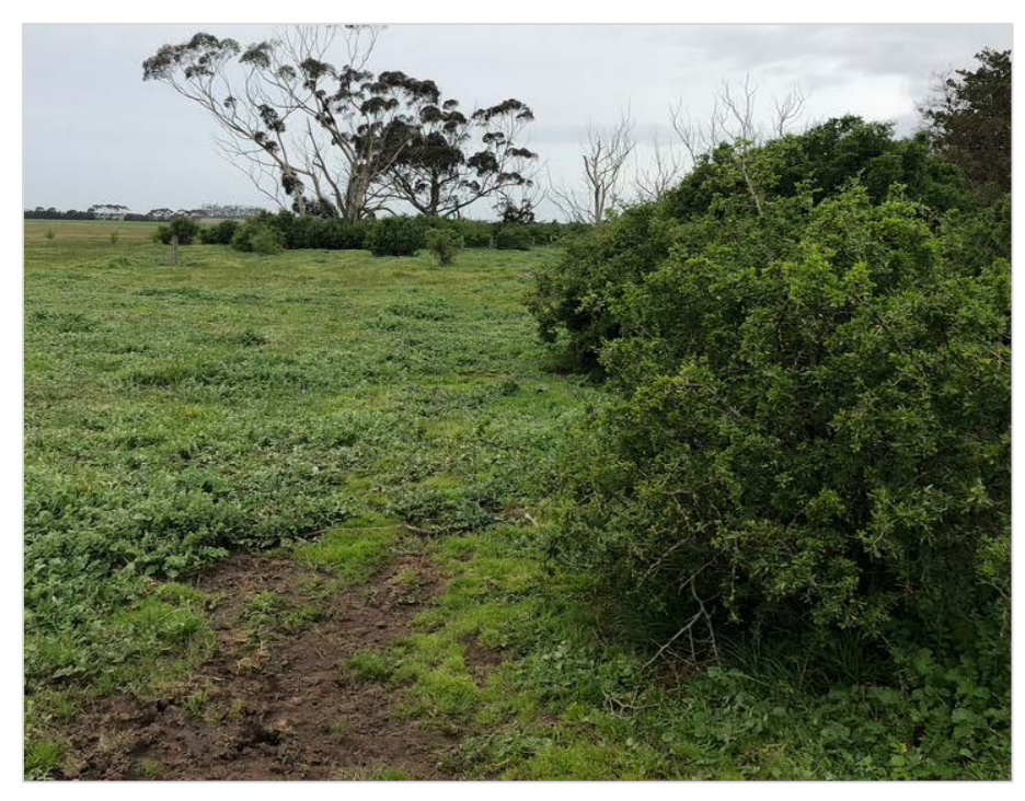
Figure 3-2: Pasture with weeds – gorse and capeweed (August 2020) – Image 1