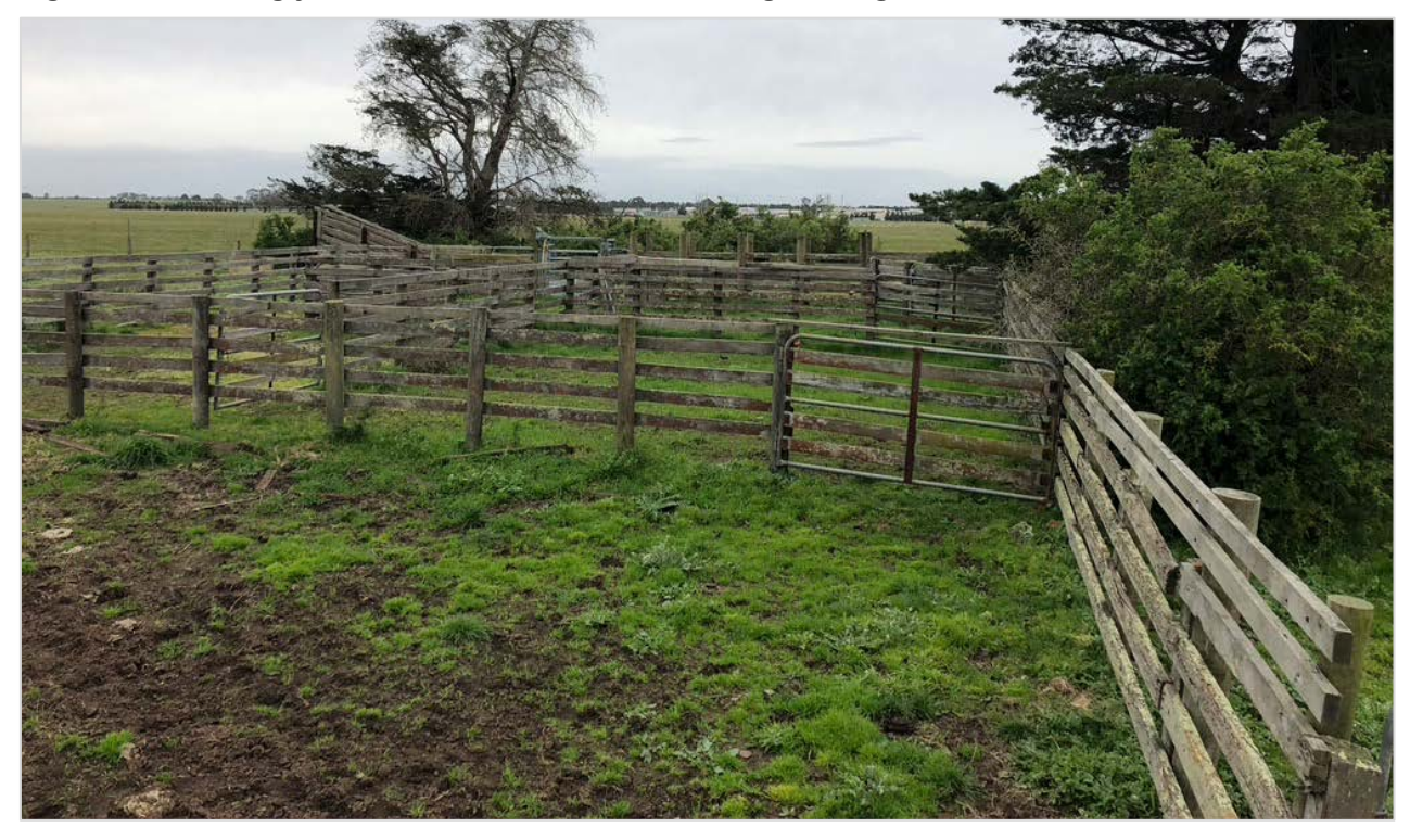
Figure 3-5: Existing yards, cattle crush and race – Image 2, August 2020

There is evidence of a reticulated stock watering system on the property, that is not in working order. There are two windmills but neither of them are currently functioning (i.e. pumping water to troughs), and a series of stock water troughs. Stock water is currently provided via six small dams (Figure 3-8). This would limit the stock carrying capacity on the site, especially during dry periods.