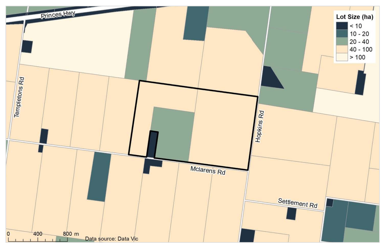
Figure 3-13: Size of lots in the immediate vicinity of the proposed site