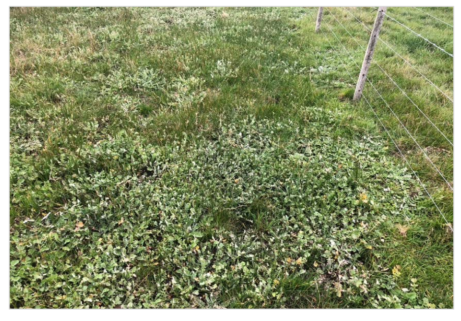
Figure 3-3: Pasture with weeds – gorse and capeweed (August 2020) – Image 2

There is no evidence of any cropping activity on the property. Adjacent properties have perennial pastures and no sign of any cropping activity.