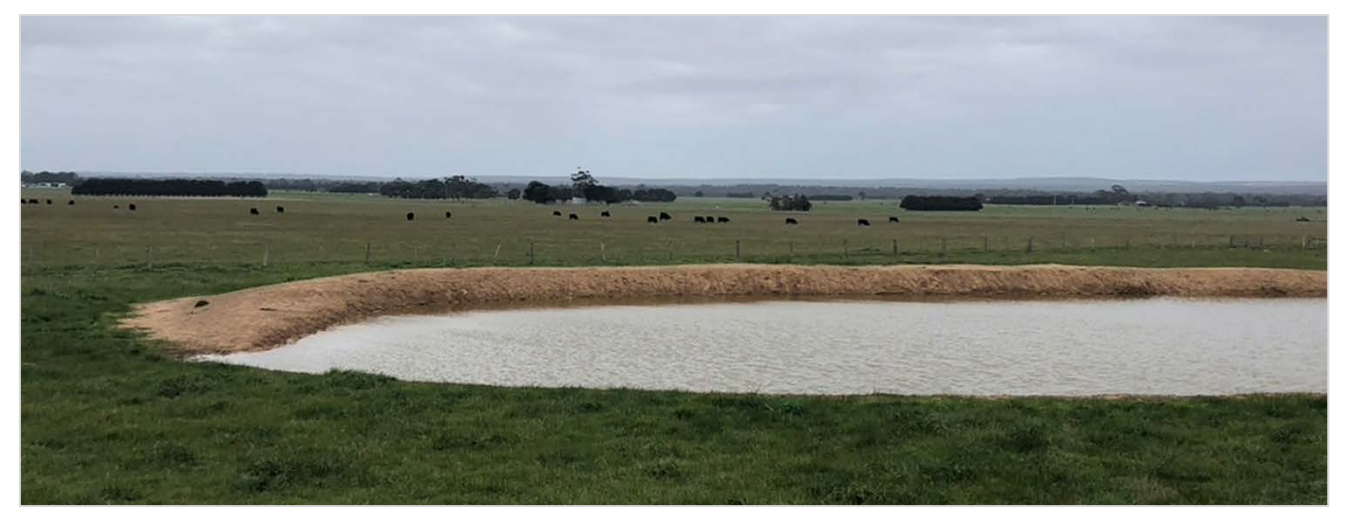
Figure 3-8: Largest of the stock water dams, August 2020