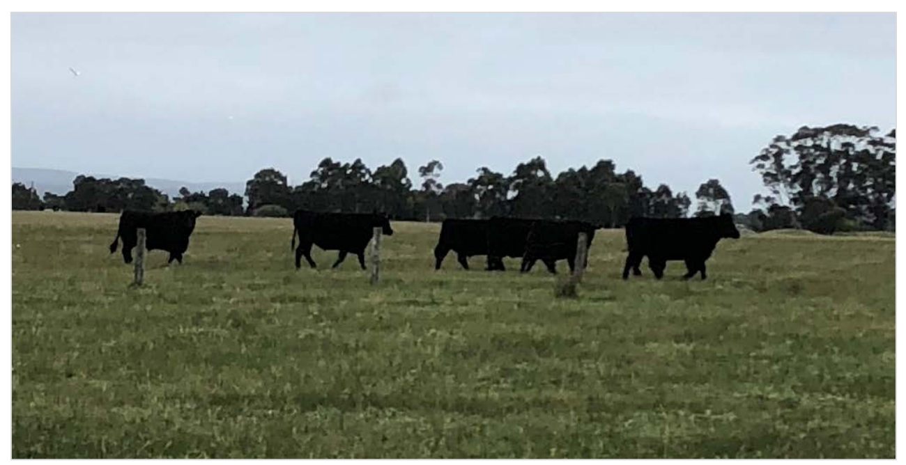
Figure 3-1: The property is currently being used to graze angus cattle (August 2020)

The site is currently operated as a beef grazing enterprise on a mix of annual and perennial pasture, as shown in Figure 3-1.