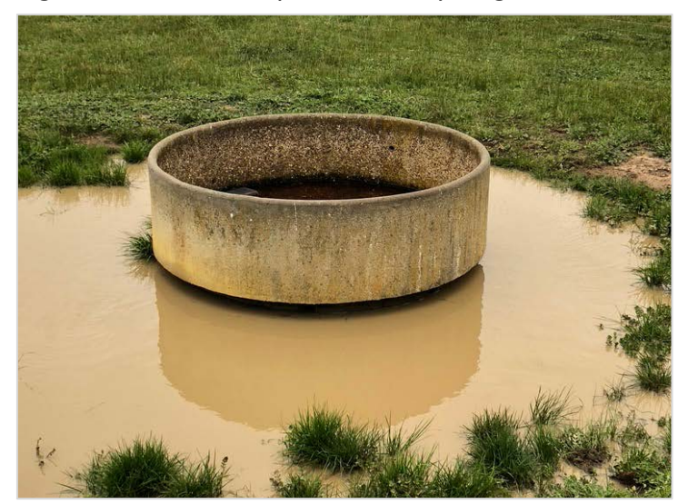
Figure 3-7: One of the stock water troughs, August 2020