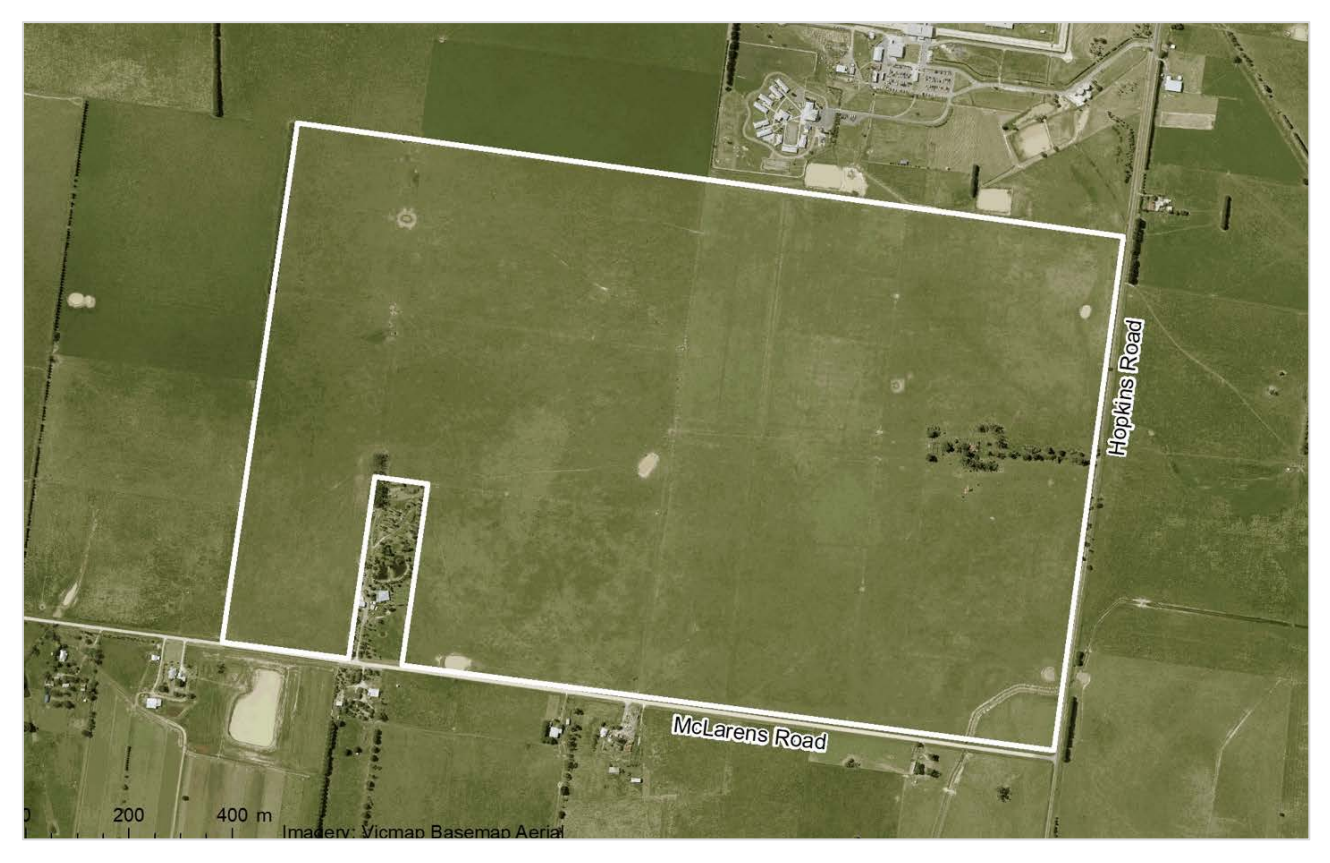
Figure 1-1: Location of proposed solar energy facility

A solar energy facility is proposed to be installed on Lot 2 LP204862 at Fulham in East Gippsland, as shown in Figure 1-1. The site is approximately 160 ha and is bordered by McLarens Road to the South and Hopkins Road to the east. The site sits within the Wellington Shire.